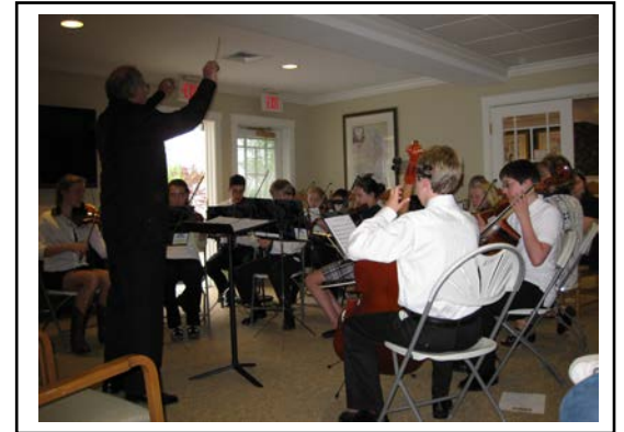
Bay Square at Yarmouth Outreach Concert