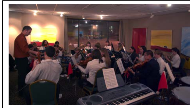
Eastland Park Hotel Holiday Concert