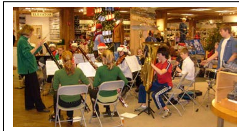
LL Bean Christmas Concert